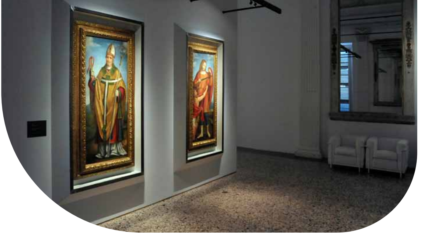
Pilkington OptiView™ OW Bernardino Luini Museum Italy